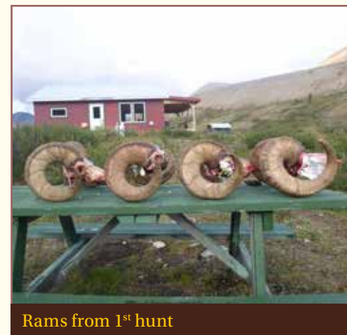
Rams from 1 st hunt

Wilderness – a natural tract of land uninhabited by humans and not significantly altered by their activity. The recent signing of the Peel Watershed Management plan was a huge victory for wilderness protection! Within this watershed are the Snake and Bonnet Plume Rivers representing the core of our Outfitting Concession. Dall sheep, moose, caribou and grizzly can now look forward to a life unfettered by industrial development, roads, or mining activity. Clients can continue to enjoy sustainable, regulated hunting, without a frenzy of helicopters or bulldozers. Our planet needs more areas like this!