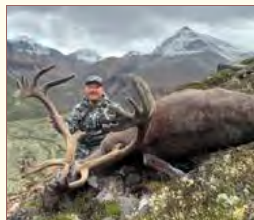
Early August bull