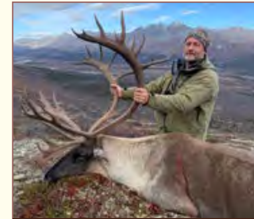
Mid September bull