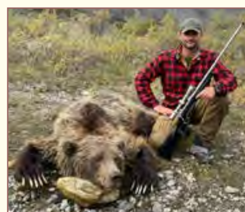
6 ft. 10"