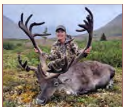
Early August bull