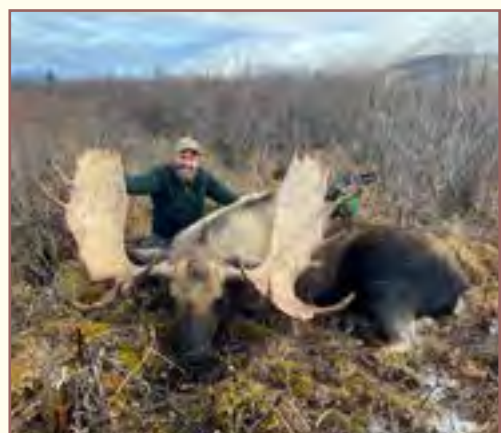
64 1/2" bow kill