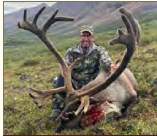
Early August bull