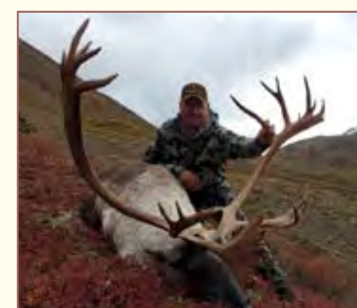
Early September bull