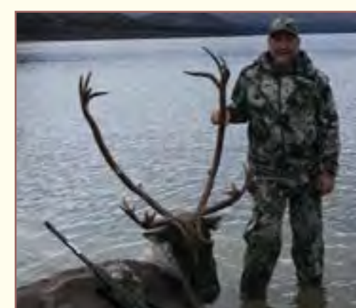
Early September bull