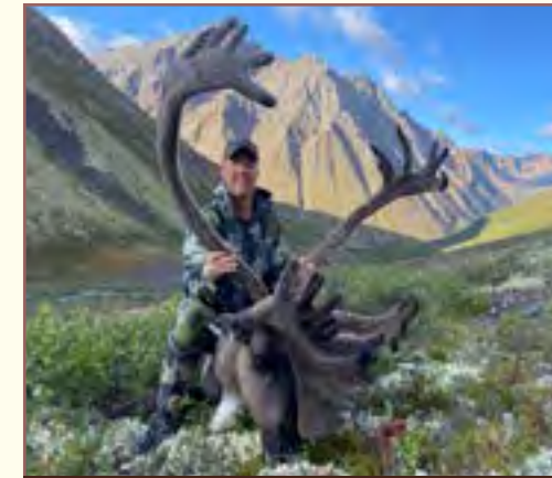
Mid September bull