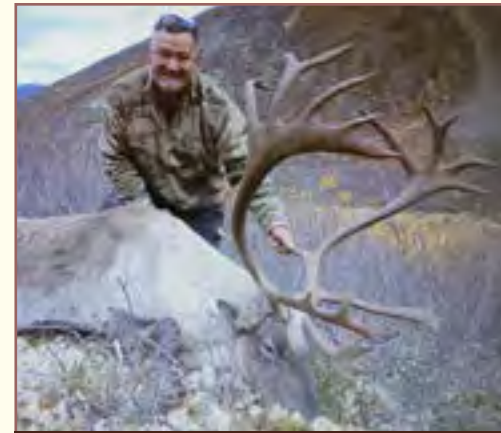
Mid September bull