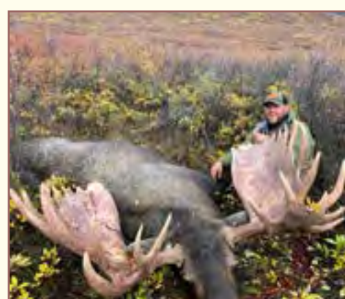
60" record book bull