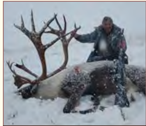
Late September bull